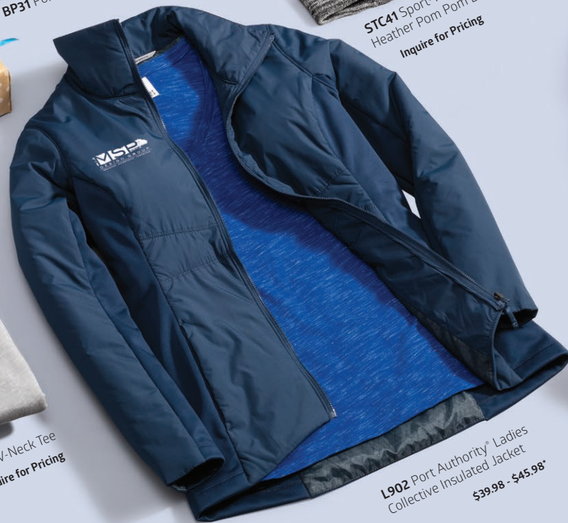
L902 Port Authority® Ladies Collective Insulated Jacket $39.98 - $45.98*