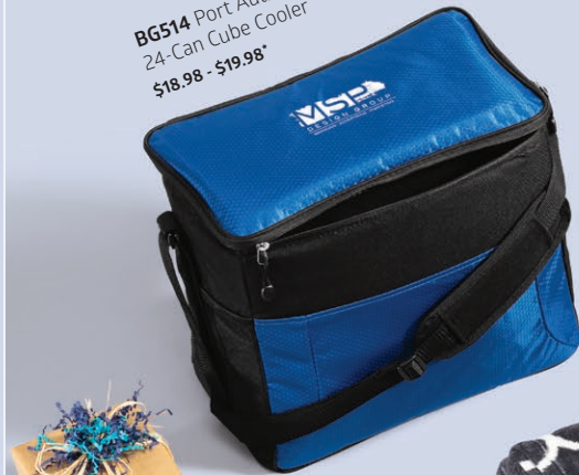
BG514 Port Authority® 24-Can Cube Cooler $18.98 - $19.98*