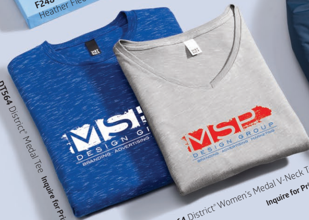
DT664 District® Women's Medal V-Neck Tee Inquire for Pricing