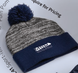
STC4 Sport-Tek® Heather Pom Pom Beanie Inquire for Pricing