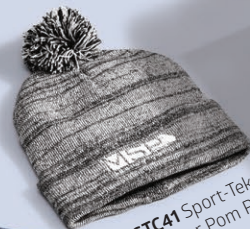
STC41 Sport-Tek® Heather Pom Pom Beanie Inquire for Pricing