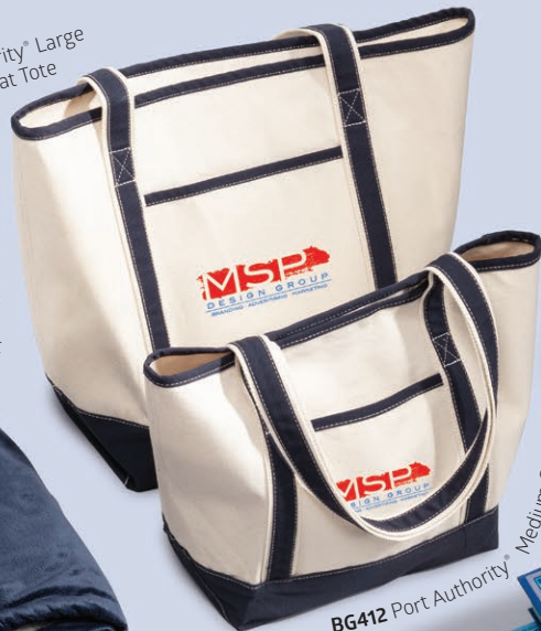
Medium Cotton Canvas Boat Tote $23.98 - $25.98*