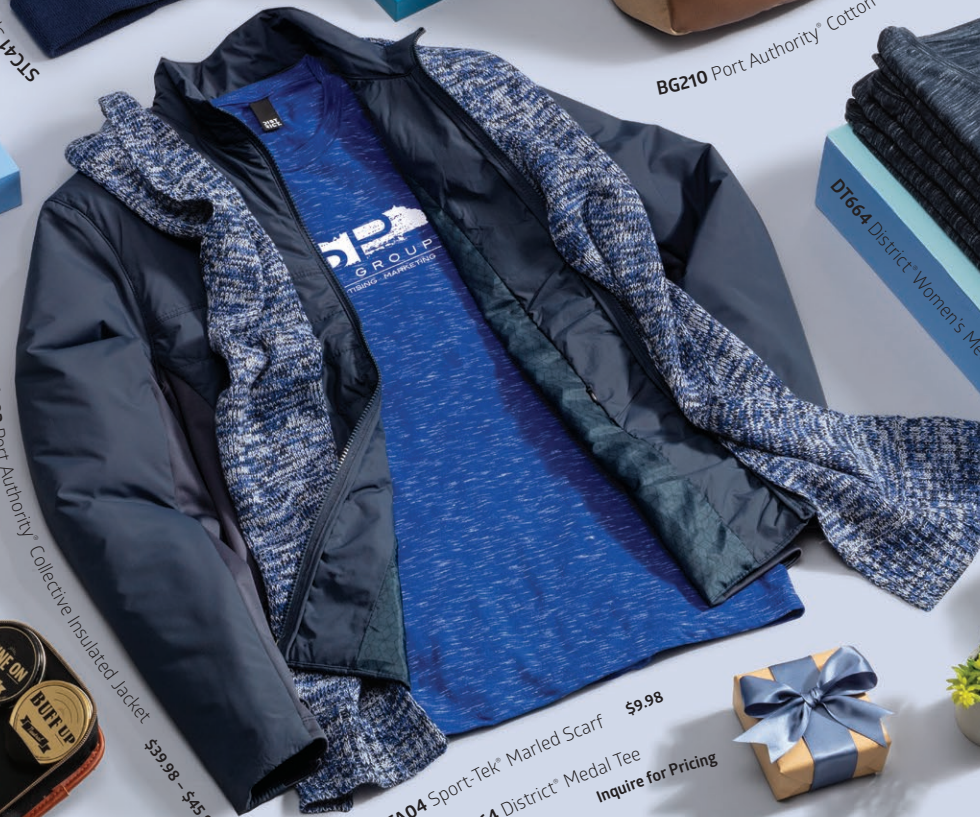
STA04 Sport-Tek® Marled Scarf $9.98 DT564 District® Medal Tee Inquire for Pricing