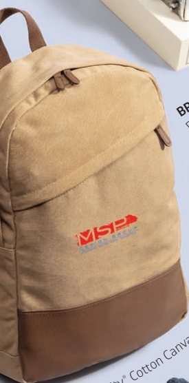
BG210 Port Authority® Cotton Canvas Backpack $33.98 - $36.98*