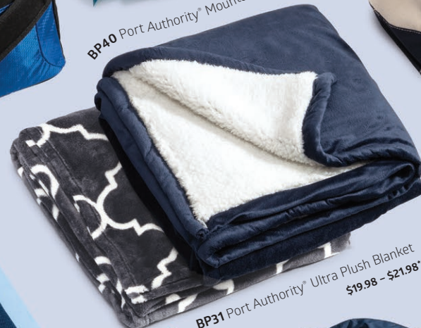
BP31 Port Authority® Ultra Plush Blanket $19.98 - $21.98*