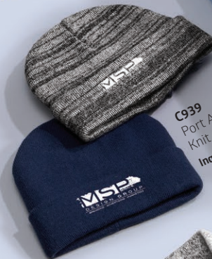
C939 Port Authority® Knit Cuff Beanie Inquire for Pricing