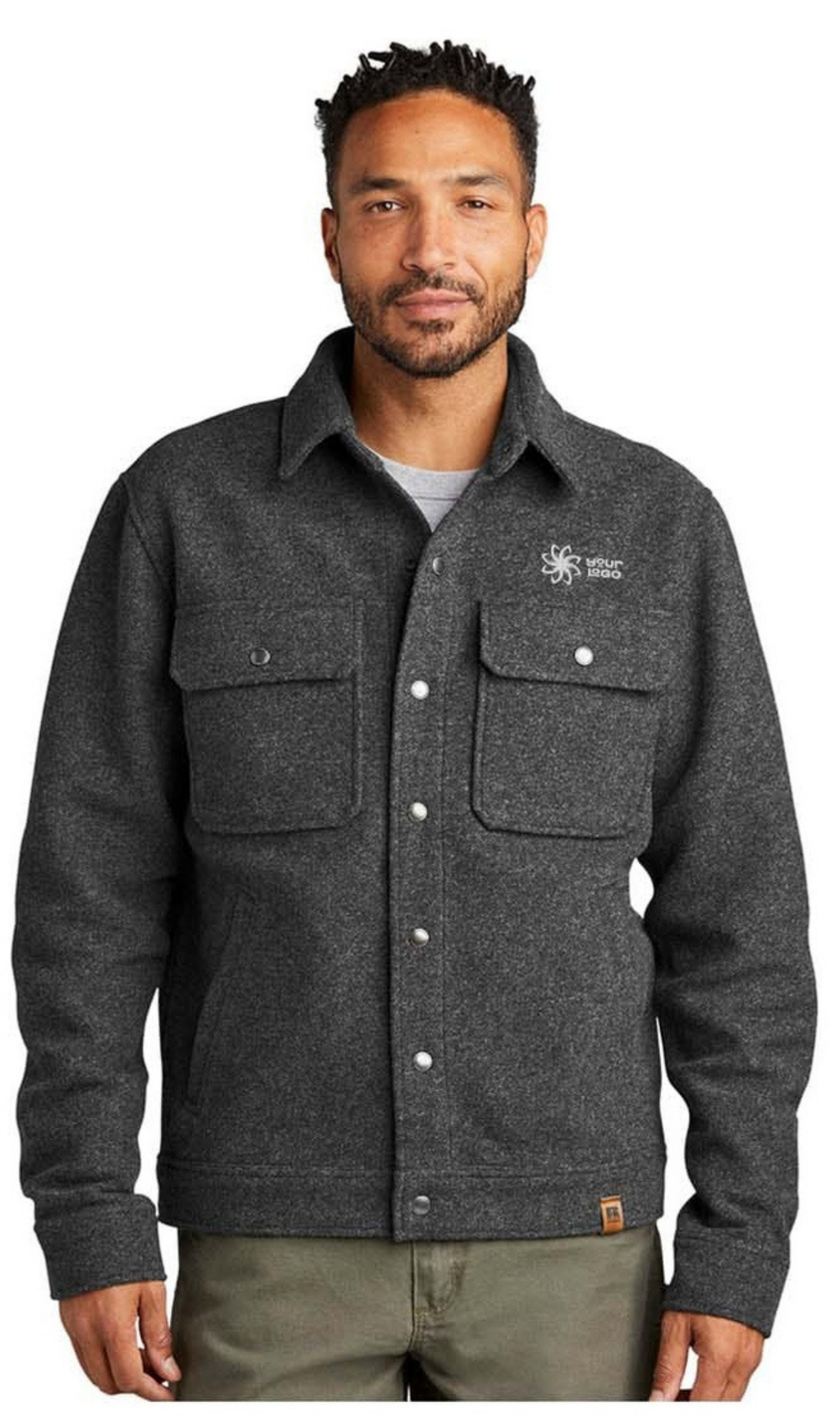
Russell Outdoors™ Basin Jacket

Experience comfort and style with the Russell Outdoors™ Basin Jacket. This jacket features a heavy wool-like feel, making it perfect for layering. With its aviator-inspired design, it's suitable for casual outings, corporate retreats, or hikes.