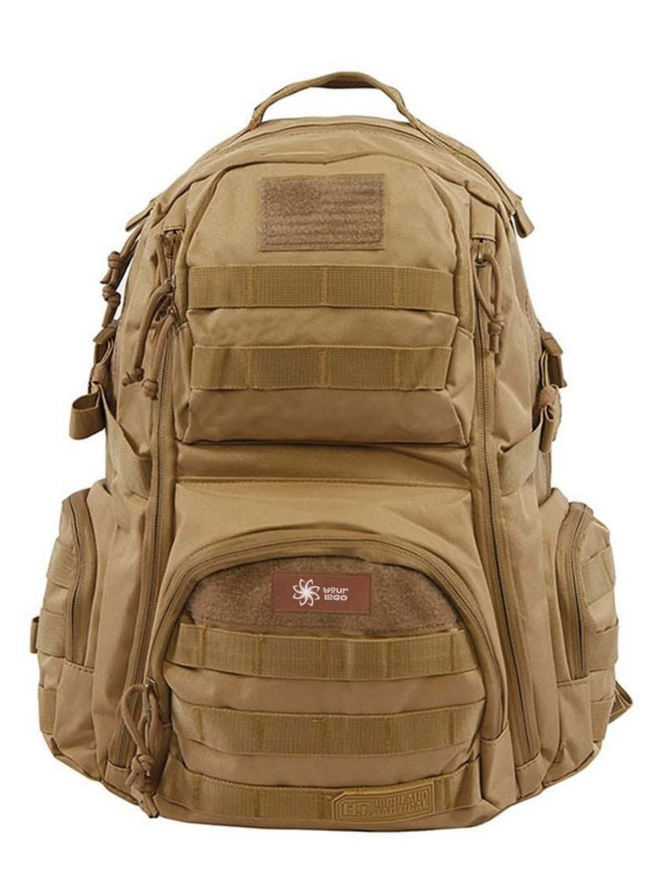
Highland Tactical® Crusher Laptop Backpack

Keep your meals fresh and cool with this stylish lunch cooler bag. Made from durable Austin 300D Nylon, it features a spacious main compartment and multiple pockets for organization. Perfect for on-the-go lifestyles, this bag is both functional and trendy.