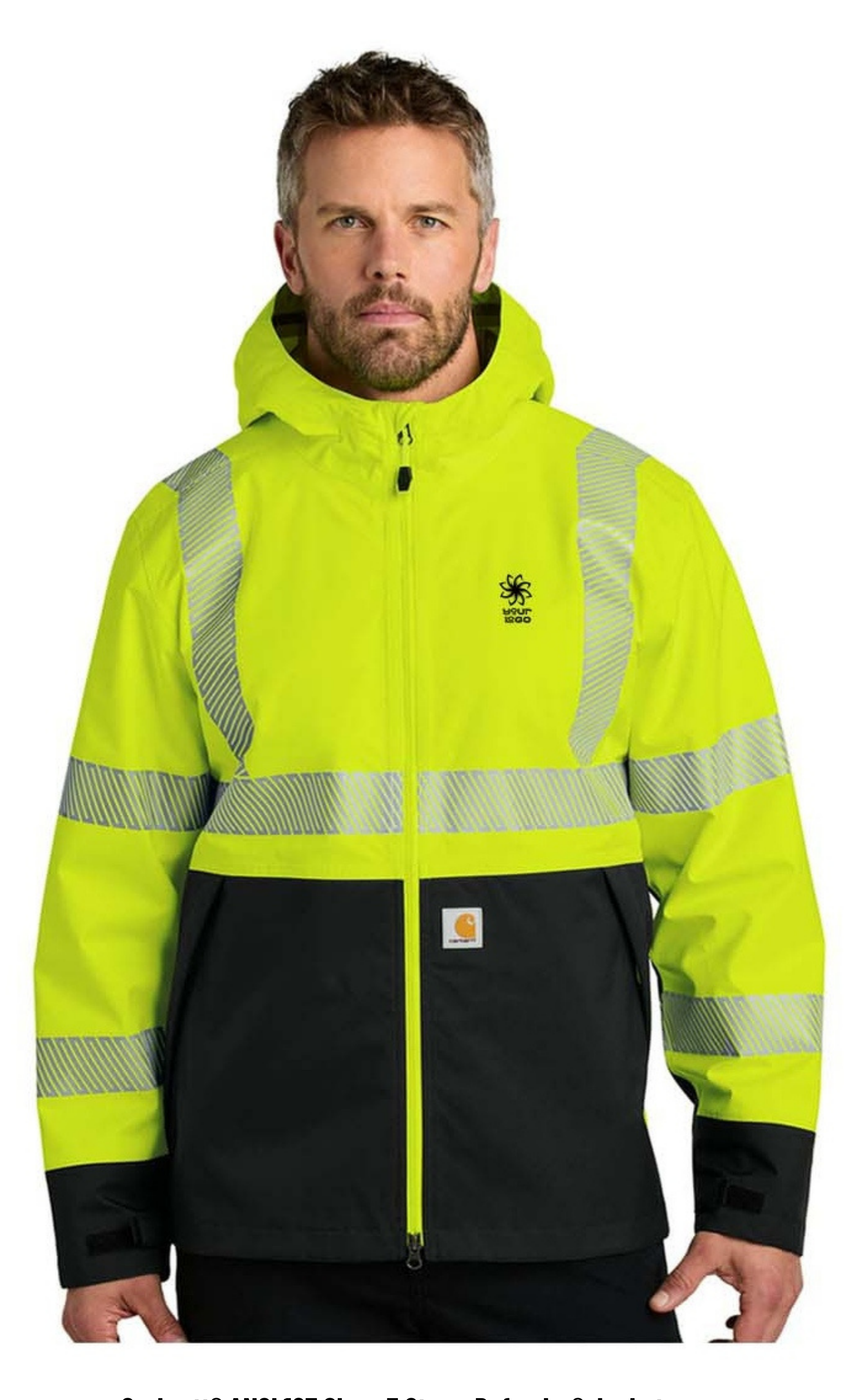
Carhartt® ANSI 107 Class 3 Storm Defender® Jacket

Experience comfort and style with the Russell Outdoors™ Basin Jacket. This jacket features a heavy wool-like feel, making it perfect for layering. With its aviator-inspired design, it's suitable for casual outings, corporate retreats, or hikes.