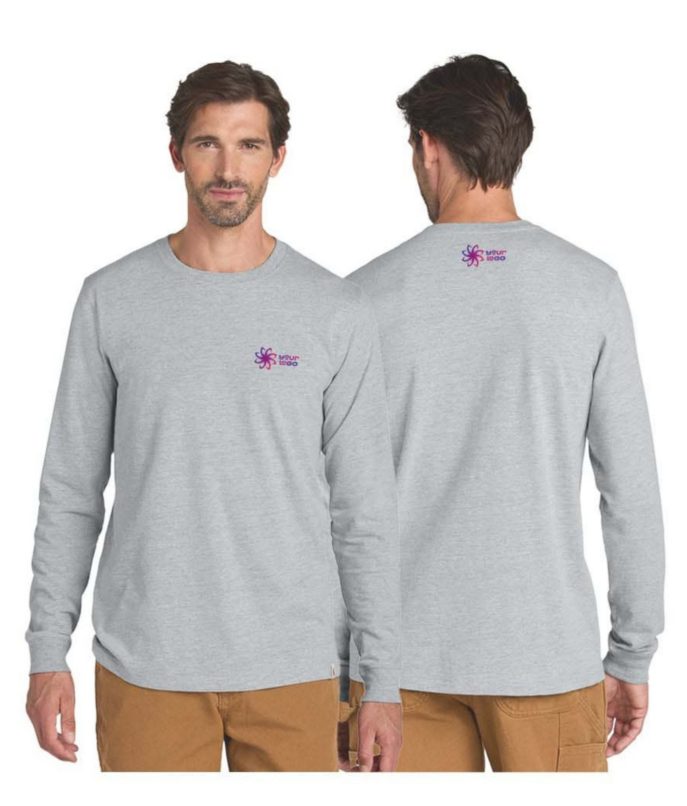
Carhartt® Long Sleeve T-Shirt

Stay visible and comfortable with this high-performance safety tee. Made from breathable, moisture-wicking mesh, it features durable reflective tape that meets ANSI 107 standards for maximum visibility. Available in adult sizes S-5XL, this tee is perfect for Class 2 environments.