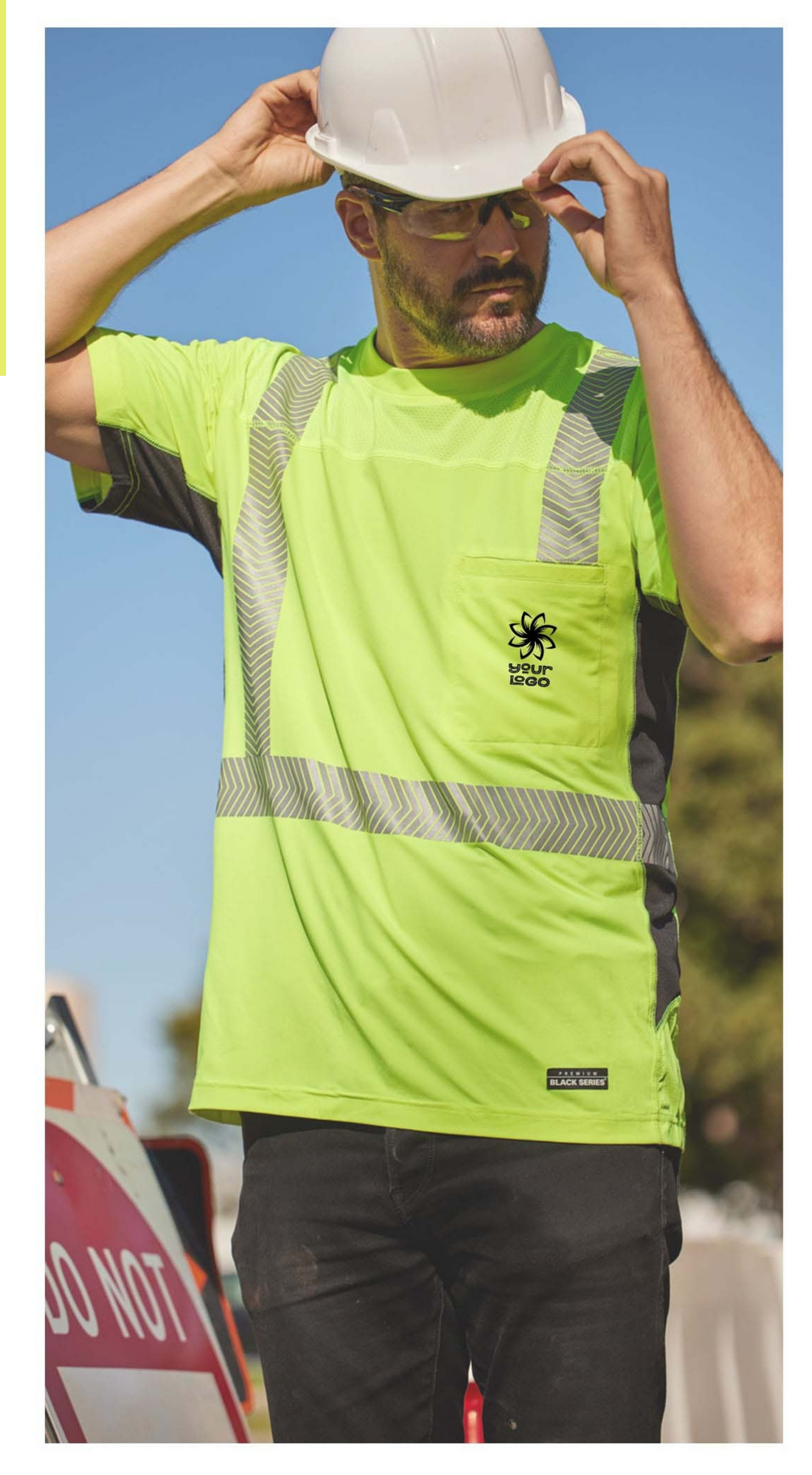
Kishigo Premium Black Series® Cool Touch Class 2 Short Sleeve T-Shirt

Stay cool and visible with the Kishigo Premium Black Series® T-Shirt. This shirt features moisture-management technology and anti-odor finishing for all-day comfort. With reflective tape and a left chest pocket, it's perfect for safety and convenience.