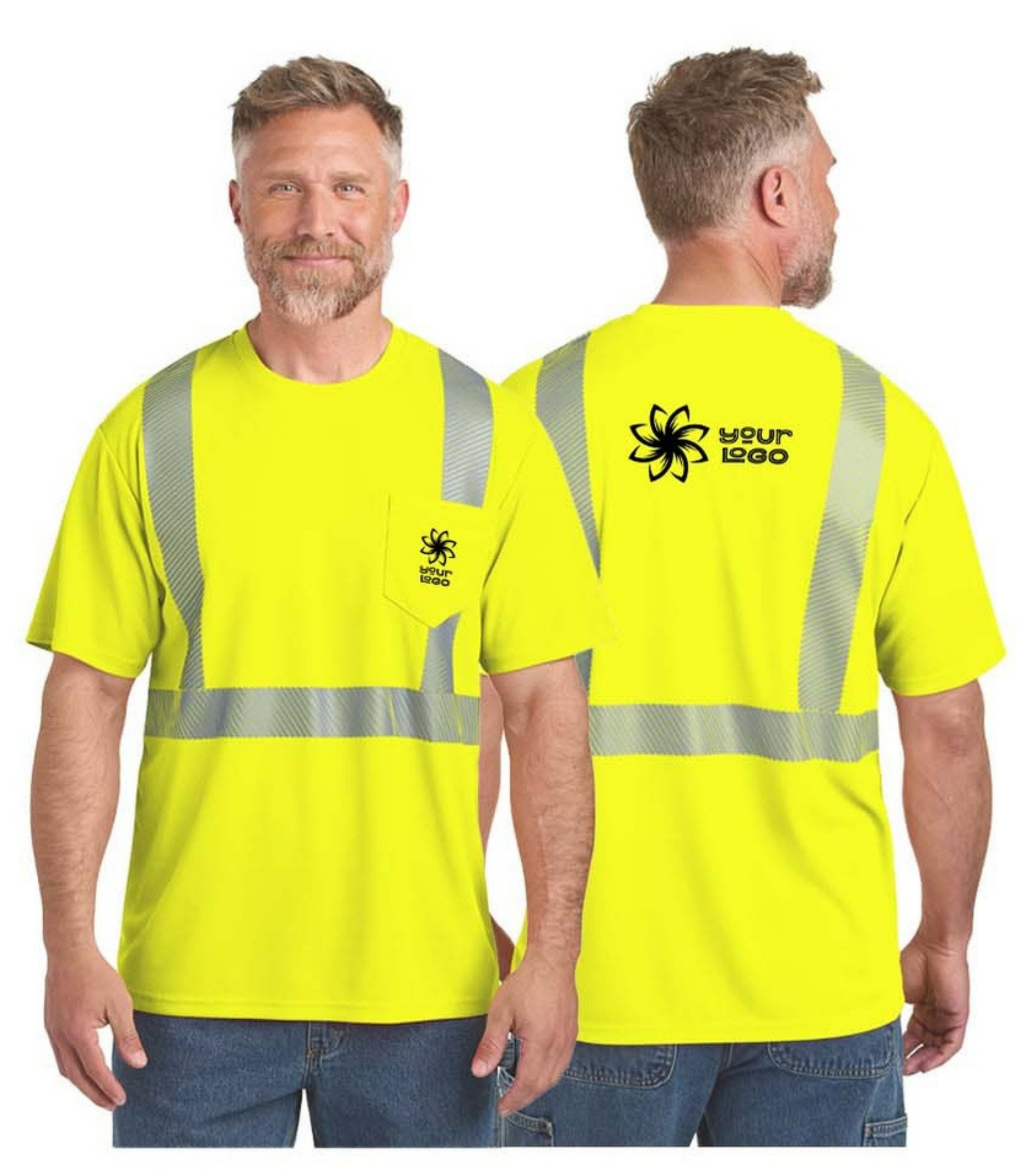
CornerStone® ANSI 107 Class 2 Segmented Tape Tee

Stay visible and comfortable with this ANSI compliant mesh tee. This breathable, moisture-wicking shirt features durable reflective tape for 360-degree visibility, ensuring safety in any environment. Available in adult sizes S-5XL and made from 100% polyester birdseye mesh.