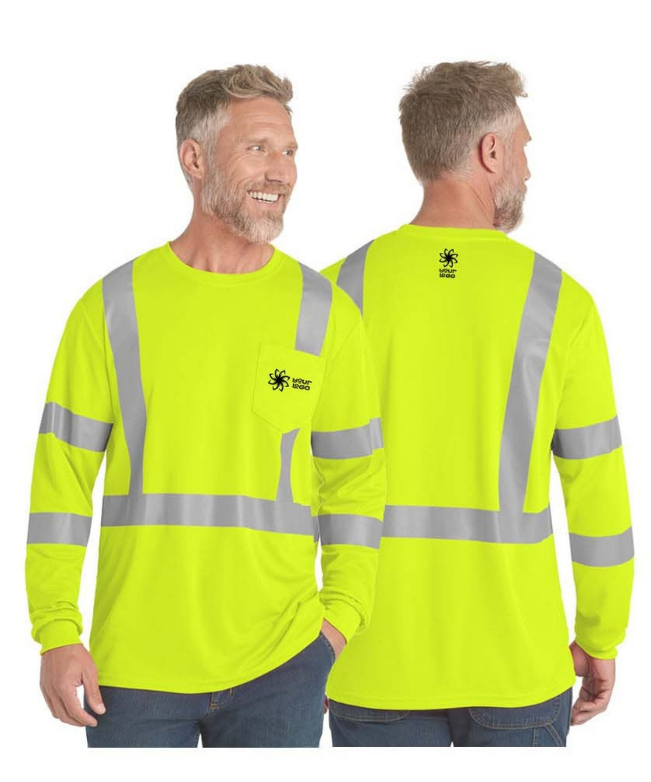
CornerStone® ANSI 107 Class 3 Mesh Long Sleeve Tee

Durable and comfortable, the Carhartt® Workwear Pocket T-Shirt is a classic work shirt. Made from 6.75-ounce, 100% cotton jersey knit, it features a tagless neck label and a left chest pocket for convenience. Available in a variety of colors and sizes, this shirt is designed to withstand the rigors of daily wear.