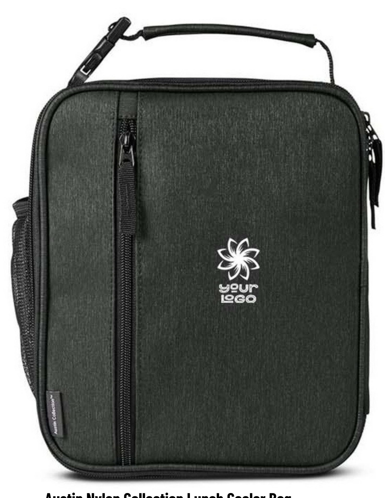
Austin Nylon Collection Lunch Cooler Bag

Keep your meals fresh and cool with this stylish lunch cooler bag. Made from durable Austin 300D Nylon, it features a spacious main compartment and multiple pockets for organization. Perfect for on-the-go lifestyles, this bag is both functional and trendy.