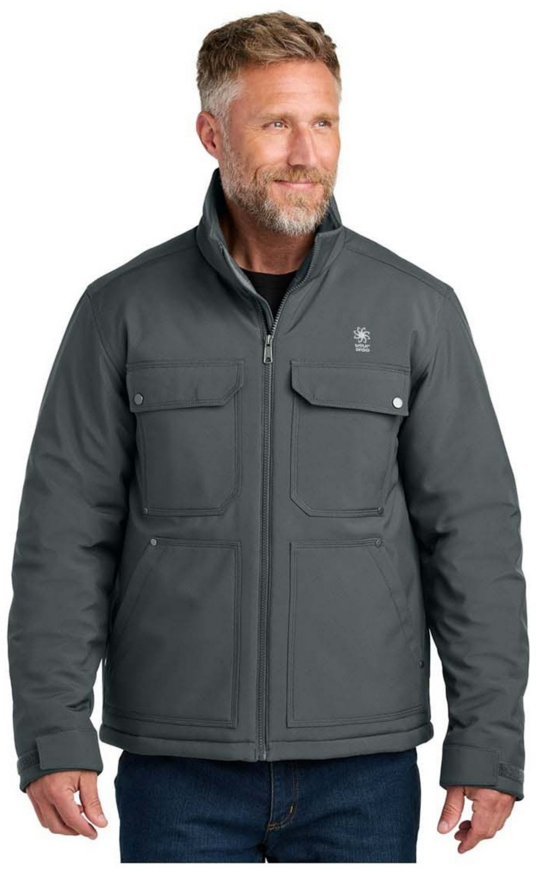
CornerStone® Insulated Workwear Soft Shell

Stay visible and dry with this waterproof jacket designed for wet weather conditions. Made from 5.25-ounce, 100% polyester three-layer twill, it meets ANSI/ISEA 107 Class 3 standards for visibility. Featuring Storm Defender® technology, fully-taped seams, and adjustable features, this jacket ensures comfort and safety on the job.