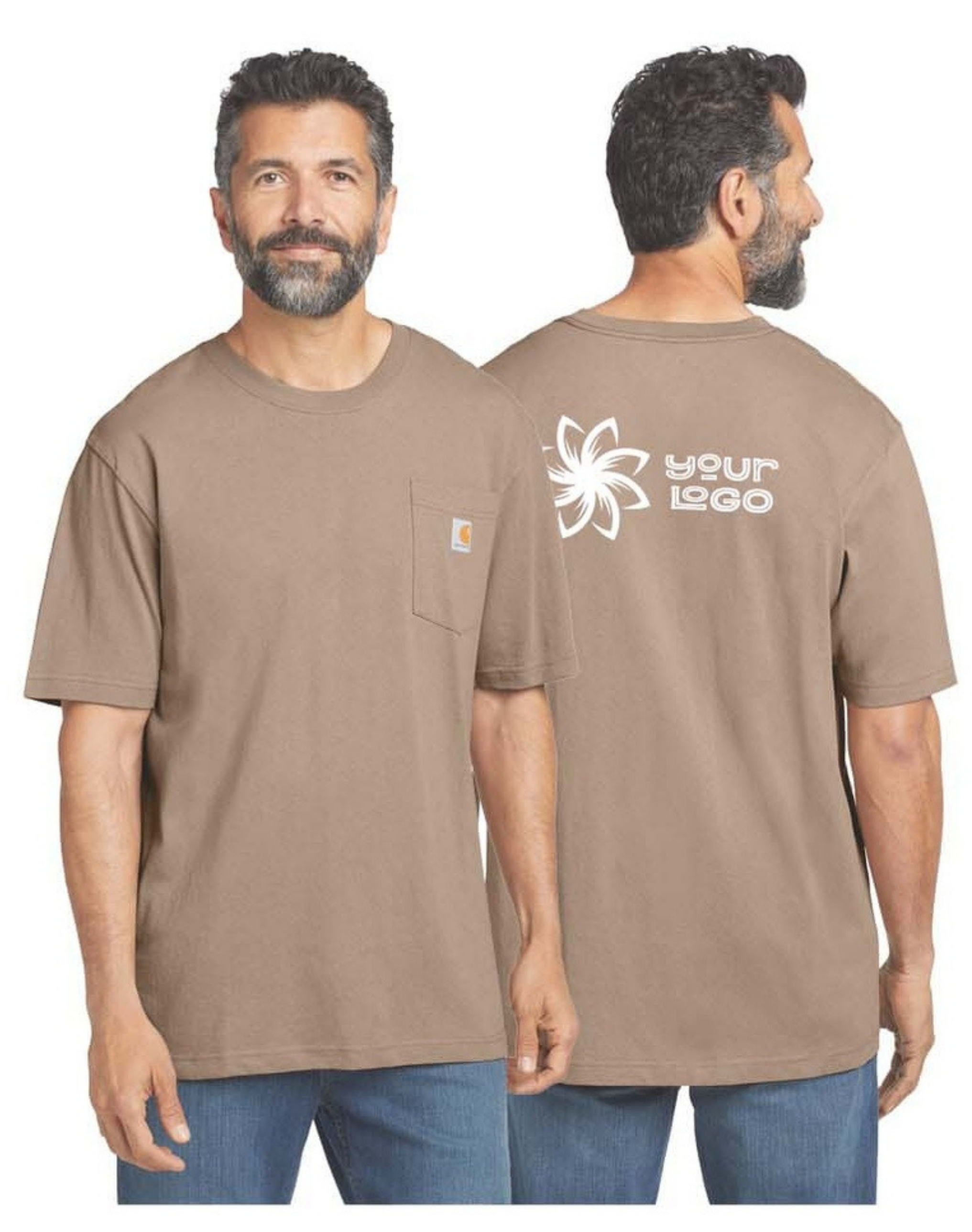
Carhartt® Workwear Pocket Short Sleeve T-Shirt

Stay cool and visible with the Kishigo Premium Black Series® T-Shirt. This shirt features moisture-management technology and anti-odor finishing for all-day comfort. With reflective tape and a left chest pocket, it's perfect for safety and convenience.